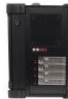
Side View Open