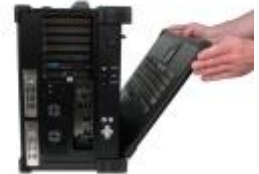
Side View Opening