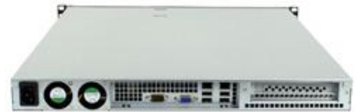
(Rear View of Stealth 1U Server Rack)