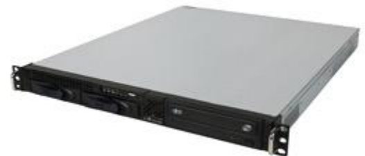
(Front View of Stealth 1U Server Rack)