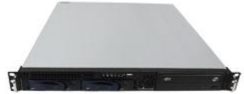
(Front View of Stealth 1U Server Rack)