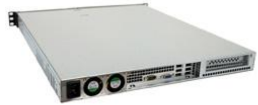
(Rear View of Stealth 1U Server Rack)

Note: Specifications are subject to change without notice. All other trademarks and copyrights are the property of their respective owners.