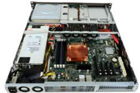
(Inside View of Stealth 1U Server Rack)