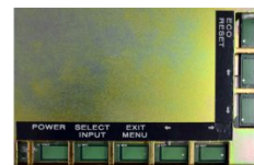
Controls (Rear Mounted)