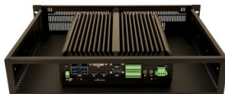
SR-2860 Front View