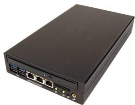
LPC-480G4M Front View