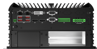
Rear view with optional 2-slot Expansion Kit