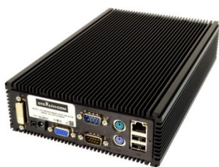
LPC-480G4FS Front View