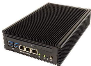
LPC-480G4FM Front View