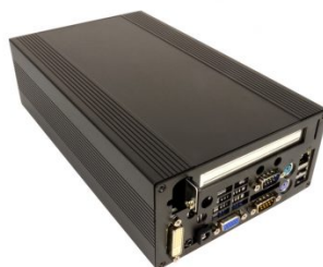
LPC-480PCleG4 Front View