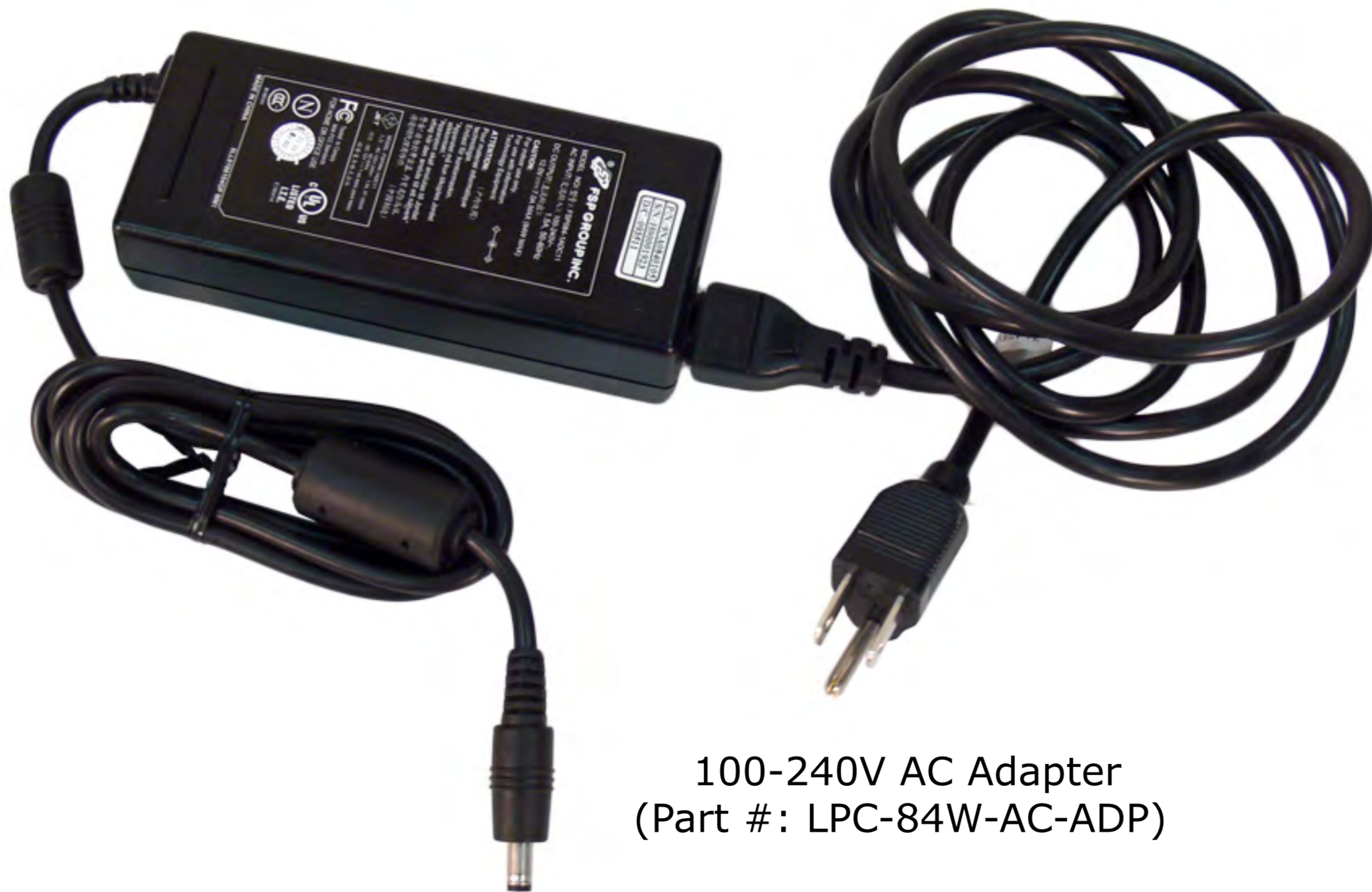
100-240V AC Adapter (Part #: LPC-84W-AC-ADP)

Note: The Mobile Bench Test Kit is for use with the following models: